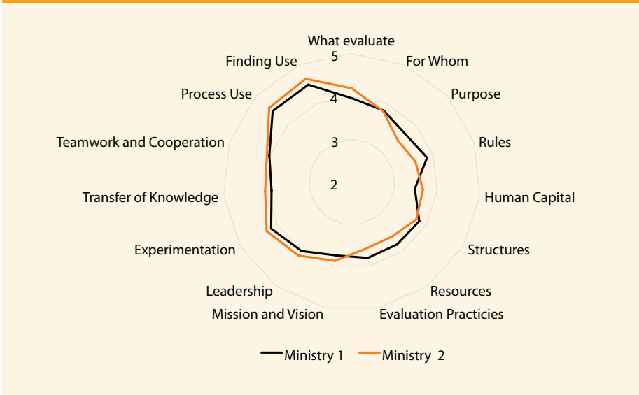
FIGURE 2. MATURITY PROFILE OF EVALUATION SYSTEMS

and the use of evaluation knowledge. There were 24 questions in total.